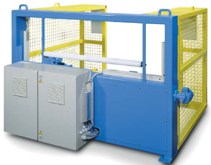
Driven Take-up Stand Type SAF